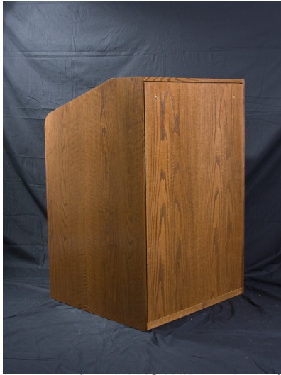
(model USAVID32 shown)