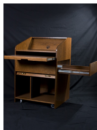
Left image of USAVID32 in Basic configuration. Center and right shows USAVID32 with optional keyboard pullout, rack bay, rolltop tambour door and right-hand document camera/projector drawer.

Drawing Notes: The maximum usable rack depth for equipment in the optional rack is minimally 20.375". Total vertical rack space varies due to other selected options. Refer to the drawing above or contact HSA for further information. There is a 1.50" maximum clearance between the backside of the tambour door and the front surface of the rack rail. These clearances are adequate for most applications but be sure to measure equipment to be installed to verify this. Additionally, a small amount of this clearance is taken by the lock assemblies. They are approximately 0.5" thick out to about 2.750" from the sidewalls and about 0.75" thick within about 0.875" of the sidewalls. Although you can be sure that standard 19" rack mount equipment will mount across our rack rails, wood is a natural product and overall working tolerances can be in the range of +/- 0.25" normally.