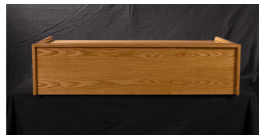
Left image of the Desktop Extended Rolltop shows the rolltop tambour door opened (rolltop door descends and "doubles-back" under the desks tabletop). Right image of desk shows fully finished desk rear.

Drawing Notes: The usable depth on the table worksurface for equipment (front to back) is considered approximately 31 inches, with an additional 3+" of open space behind that before you run into the rolltop at the back. The maximum clearance height on the worksurface is 9 inches. Additionally, a small amount of this clearance is taken by the lock assembly. Our standard lock assemblies are approximately 0.5" thick out to about 2.750" from the sidewalls and about 0.75" thick within about 0.875" of the sidewalls. Wood is a natural product and overall working tolerances can be in the range of +/- 0.25" normally.